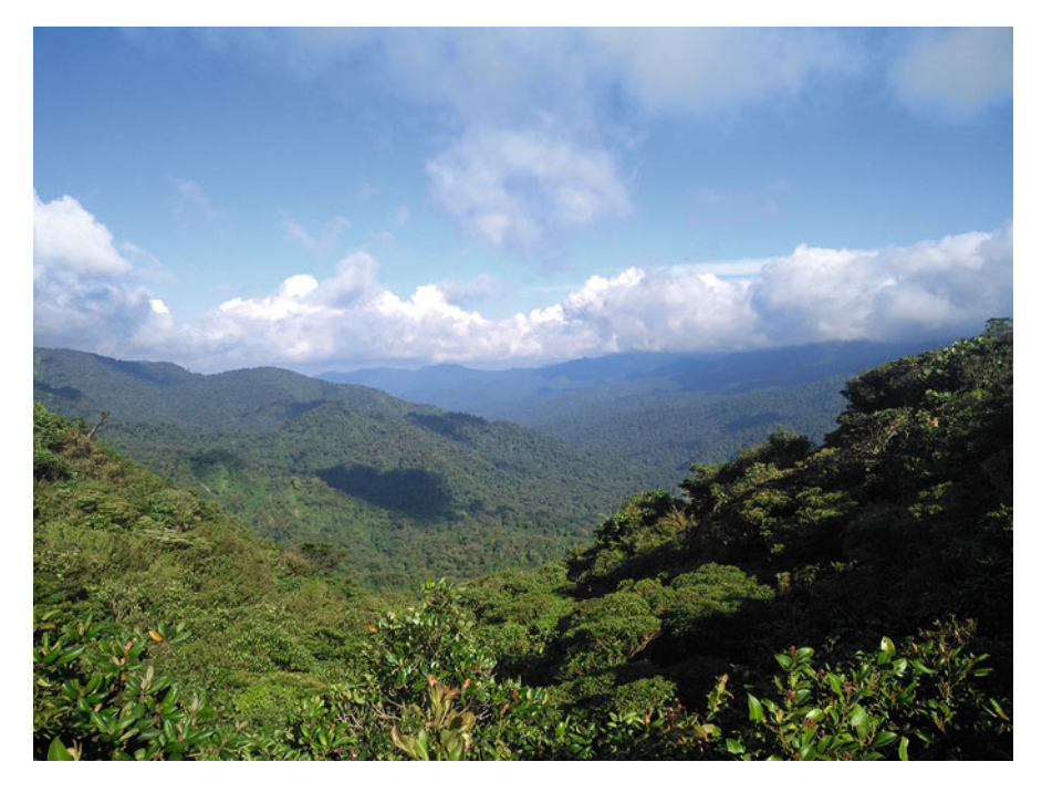
Fig. 10.3 A landscape view of the Monteverde Cloud Forest Preserve and the Children's Eternal Rainforest from the Continental Divide looking down the Atlantic slope. The Monteverde Reserve Complex represents the largest privately-owned protected area in Central America.

evolution of the ecological niches that established along the Continental Divide in the Tilarán Mountain range in Costa Rica, the formation of Monteverde's biodiversity island was driven by strong socio-political, economic, cultural components over decades, rather than millennia. Expansionist development policies encouraged human population incursion into forested regions. Frontiersmen's axes felled seemingly inexhaustible tropical forests, fires "cleaned" the land, and cattle farms expanded across the landscape. As Harvey and Haber (1999) describe, this process resulted in the creation of small, sometimes single remnant tree biodiversity islands throughout the Monteverde region.