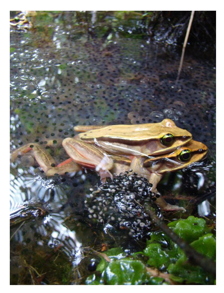
Fig. 10.5 The Green-eyed Frog ( Lithobates vibicarius ) was thought to be extinct but later reappeared in the Children's Eternal Rainforest.