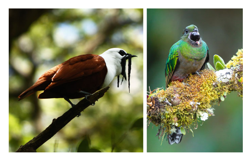
Fig. 10.4 The Resplendent Quetzal ( Pharomacros moccino ) and the Three-wattled Bellbird ( Procnias tricarunculata ) represent two of Monteverde's iconic, IUCN Red Listed bird species. Both species have attracted scientific researchers to the region and have played an important role in attracting bird watchers and nature-based tourism in general to Monteverde.

Even this flagship species has not escaped environmental threats; the Tropical Science Center<sup>2</sup> estimates a current population of 55 individual quetzals (male, female and juveniles) in the Monteverde Cloud Forest Biological Preserve (TSC unpublished data) in contrast to the 50 reproductive couples estimated by Wheelwright (1983). Hamilton et al. (2003) report habitat loss and fragmentation on the Pacific Slope as the main causes of population declines of Three-wattled Bellbirds in Monteverde. This species declined from 135 individuals in 1997, to just 90 in 2002. Current monitoring efforts by the Tropical Science Center in the Monteverde region revealed that the population of Bellbirds may be increasing; 102 individuals were identified in 2018 and 120 in 2019 (TSC unpublished data).